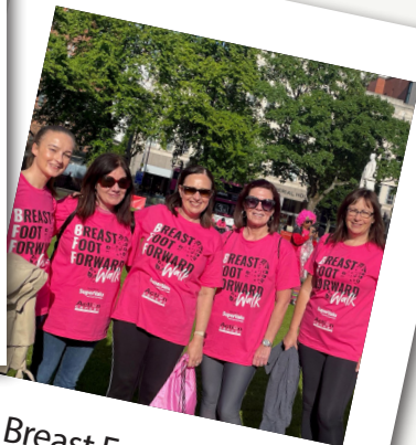
Breast Foot Forward