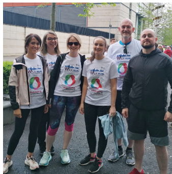
Law Society Legal Walk